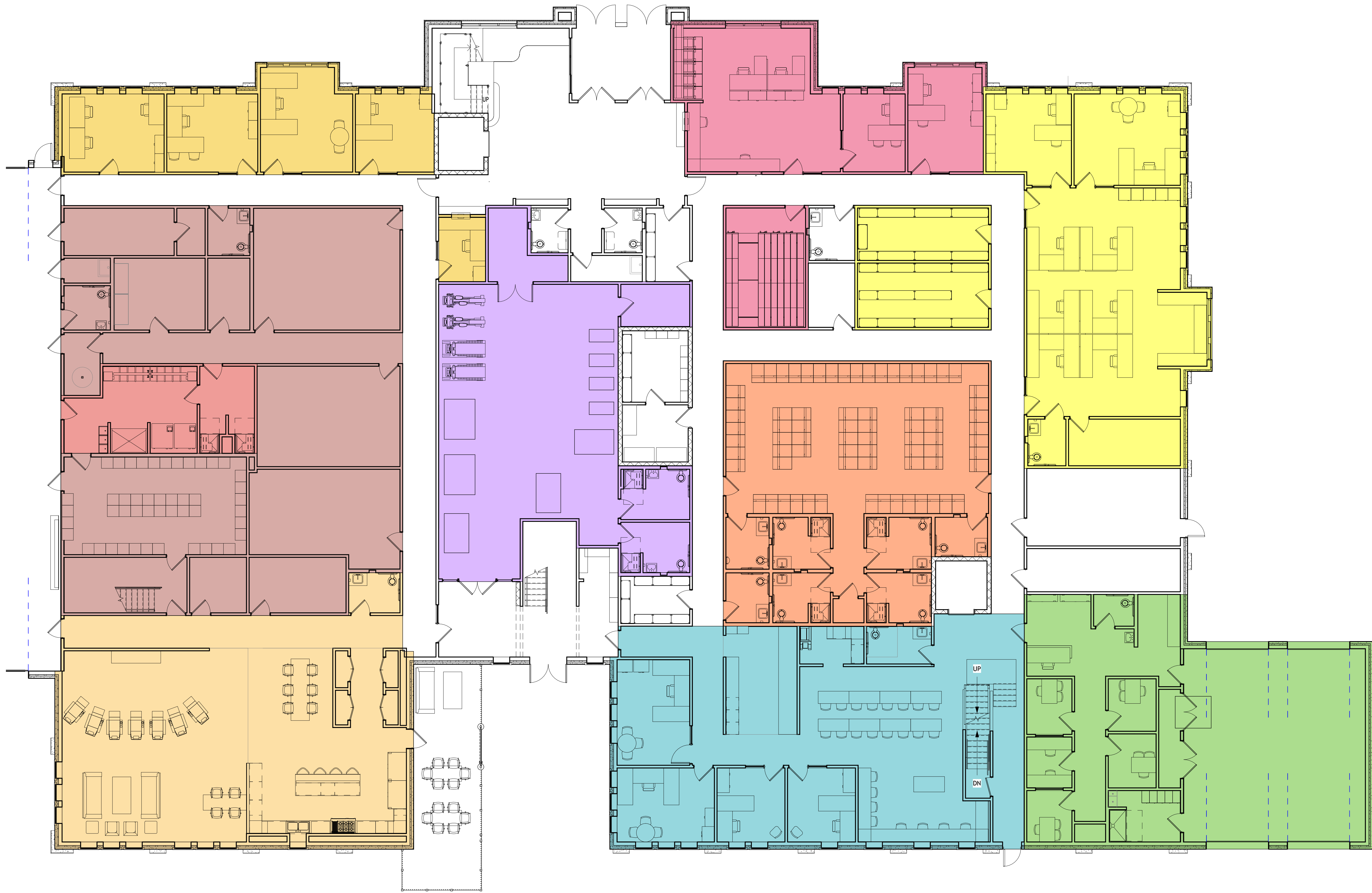
① FIRST FLOOR 1/8" = 1'-0"